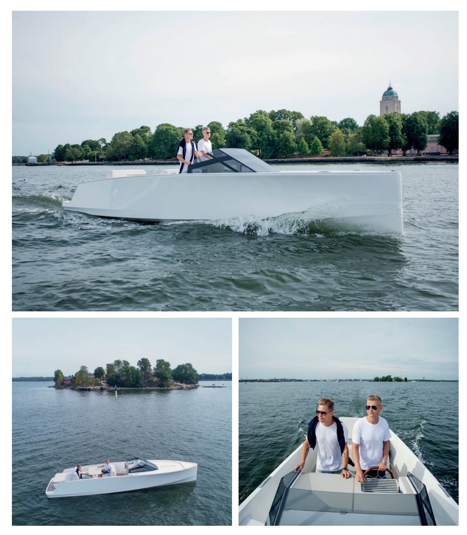
High resolution images and videos available at q-yachts.com/media Q Yachts Youtube Channel