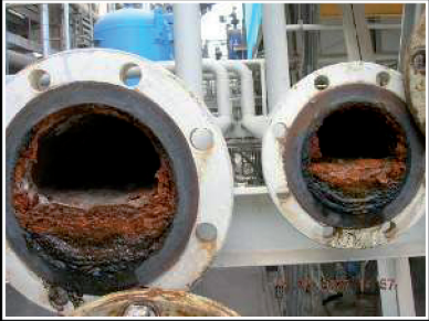
Rust, scale, fouling, ... in pipelines.