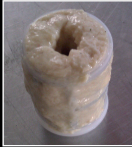
Biofilm in filter.